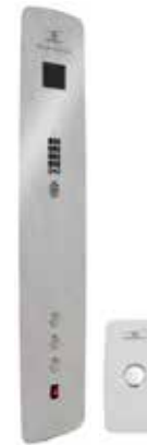
Polished Stainless Steel (Mirror)