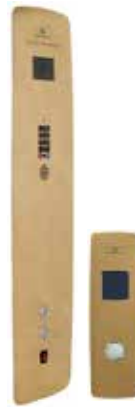
Polished Gold (Mirror)