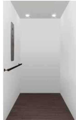
Melamine Panel (Optional)