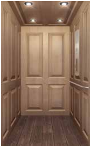
Raised Panel* (Upgrade)