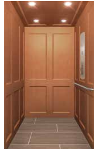
Recessed Panel* (Upgrade)