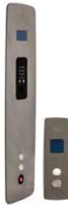
Bronze Mirror Glass