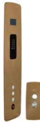
Champagne Mirror Glass