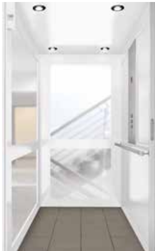
Aluminum and Glass Panel (Upgrade)