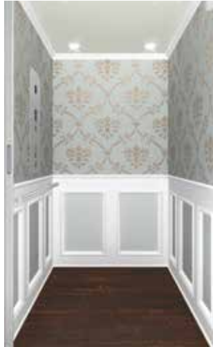
Design It Yourself / MDF Walls (Optional)